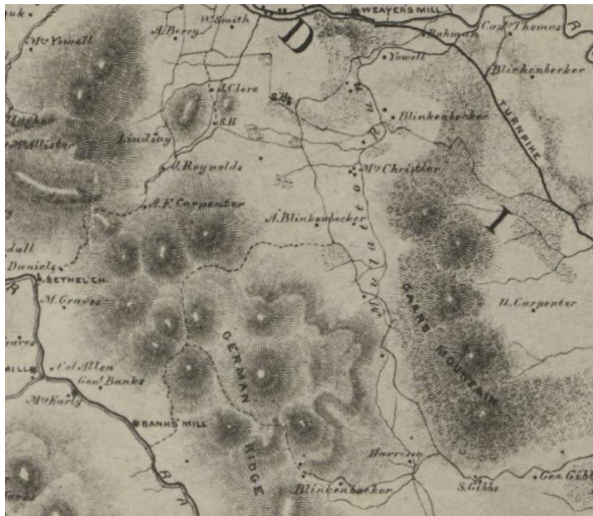
Map of Culpeper, Madison and Rappahannock; Virginia Chief Engineer's Office, 1864 47

Source: Quarterly Review List 444 Released July 6, 2021 ( https://www.usgs.gov/us-board-on-geographic-names/dnc-review-lists )