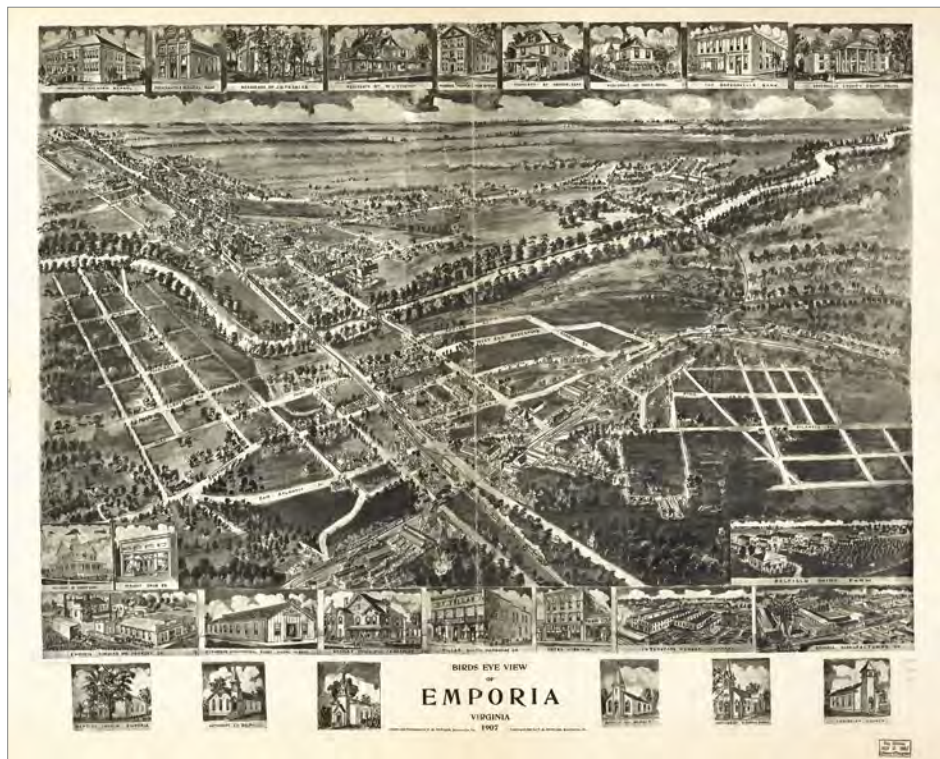
1907 Birds Eye View of Emporia, Virginia. T. M. Fowler, Morrisville, Pennsylvania.

For six weeks, the old building was flooded when it rained. The house suffered damage, as did the family's furniture. The situation also destroyed the hotel's business. The roof was restored after February