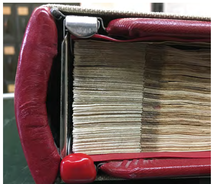
Images of Patrick County Will Book 2, 1823-1838.