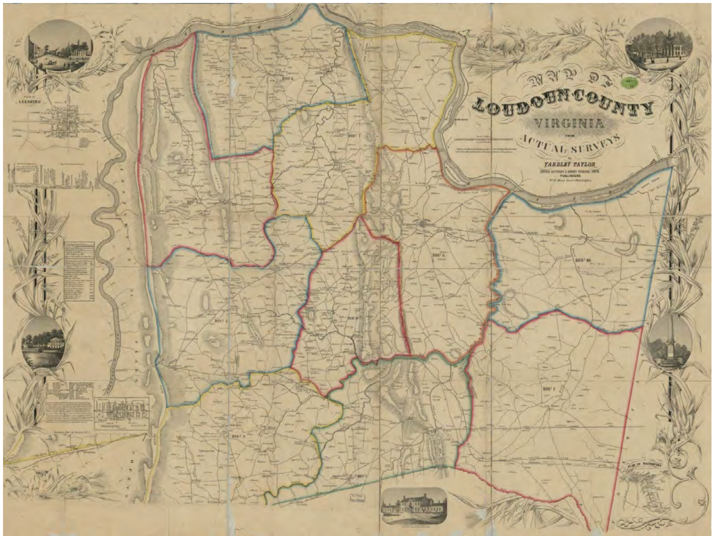
Map of Loudoun County, ca. 1854, Philadelphia: Thomas Reynolds & Robert Pearsall Smith.

From 1831 to 1835, there were 101 slave-related cases within a total of 487 cases filed. In those 101 slave-related cases, 735 enslaved people were named. These numbers led me to wonder about the economic climate for people in those times. What pushed them to fight so readily over property and estates, specifically in the year 1832? In that year alone, there were 249 chancery cases filed. I