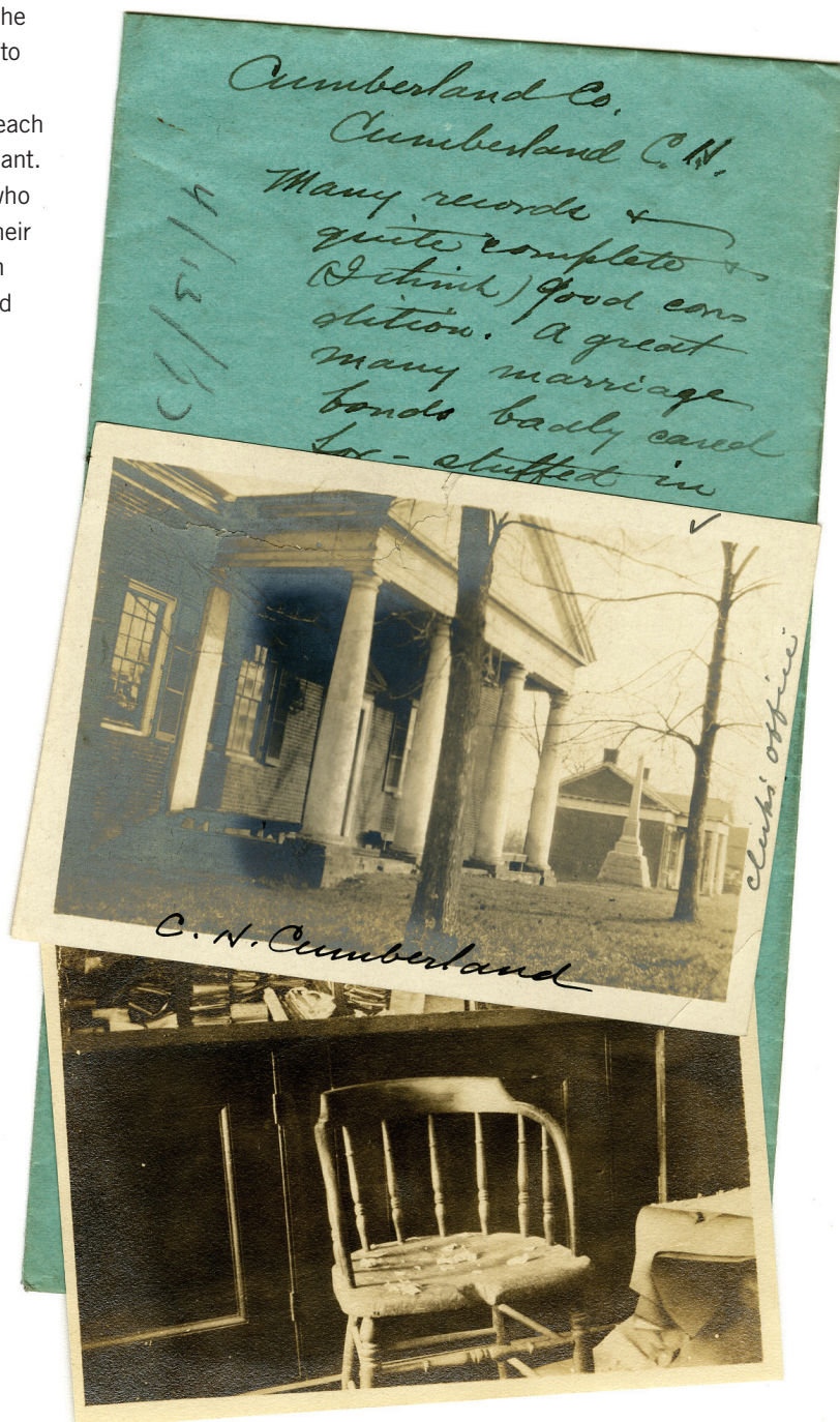
These items are from the Cumberland County Courthouse surveys, circa 1916–1918, and are from the Collection of Materials Concerning County Courthouses, records, and Clerks of Court, 1916–1929, Office of the State Archivist, Library of Virginia.

correspondence or other documentation between their predecessors and the Library of Virginia that they would be willing to share, please contact the CCRP staff at ccrp@lva.virginia.gov . ■